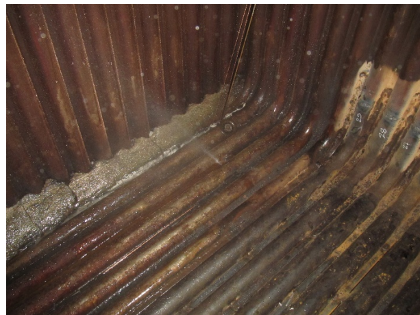
Figure 1. Example of a figure

potpis slike for the figure captions of 9 pt TNR, and also the style potpis tabele for Table captions in TNR 9 pt. Figures and Tables must not be duplicated when the paper is presented in both Serbian and English. The text in Tables is TNR 9 pt, and is centered in table columns and uses the style tekst tabele . See examples below.